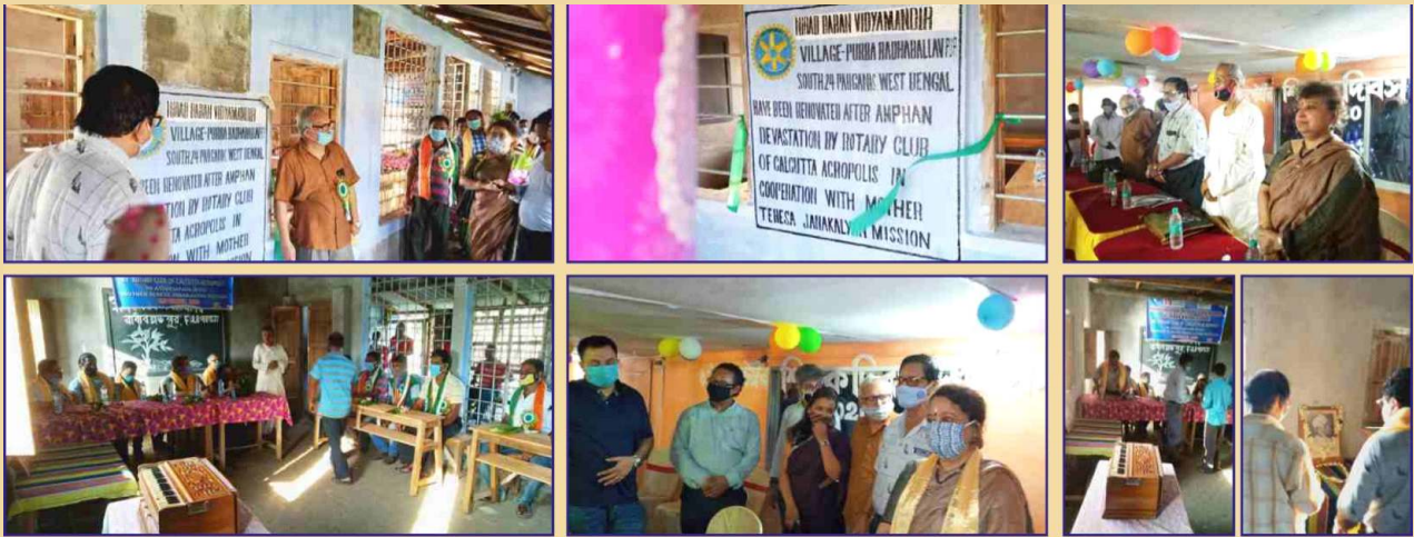
Teacher's Day celebration by Team Acropolis and school teachers