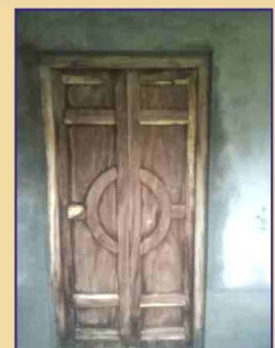
Niradbaran School after re-construction by RCC Acropolis